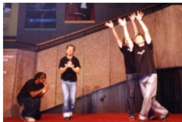
Young IDEA performers from Hong Kong, IDEA 2004