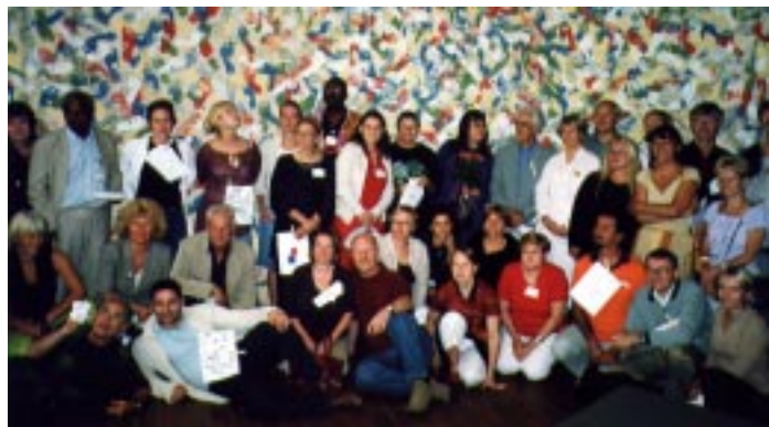
Group portrait of participants from IDEA, InSEA and UNESCO at 2003 Meeting in Helsinki, Finland