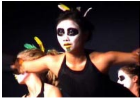
New Zealand's NZADIE actors on stage Les Polyscenes 2003, Montpellier, France

Latin America and Caribbean Islands Northern America East and South Africa Northern, Central and Western Africa Western Europe Central and Eastern Europe Central Asia South East Asia Australia, New Zealand and Pacific Islands Middle East and Arab countries Community Theatre and Drama Pedagogy Practitioners Applied Arts Practitioners and Artistic Directors