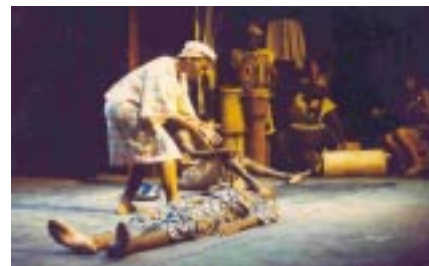
The Flame Players of Cameroon