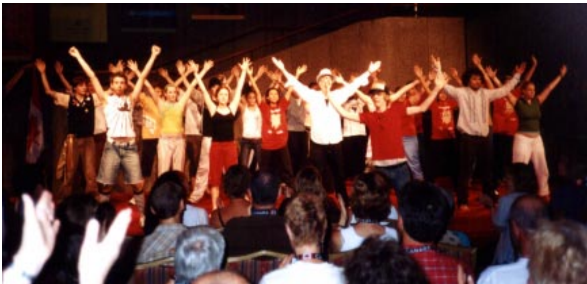
Young IDEA close IDEA 2004 with a celebration of diversity and multicultural unity

To ensure that the international convergence of practitioners from all over the world is a significant impetus for the interest and growth of theatre/drama education in Hong Kong, mainland China and Asia