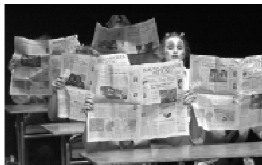
Young performers from Niedersachsen on stage at the BVDS 20th School Theatre Festival in Stuttgart, Germany, September 2004