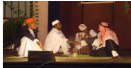
Eastern Africa Theatre Institute (EATI)

Eastern Africa Theatre Institute , in collaboration with various Swedish artists, groups and institutions, will be holding its 3 rd EATI Regional Theatre Festival from 22 nd to 27 th November, 2004 in Mombasa, Kenya to celebrate and showcase the contribution of theatre to social development. The theme Drumming up the dreams of our society celebrates the role of the artist as an upholder of the aspirations of society in its quest for betterment. The festival celebrates the role of theatre in addressing HIV and AIDS, conflict resolution, poverty reduction/eradication, gender and child education. Further information is available from Ghonche Materego : gmaterego@yahoo.com